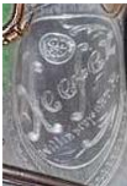
Style 6: Eagle and keystone with Keefeer and large K [possibly by Arthur Magliocco]