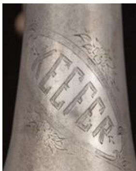
Style 5: swirl logo with Keefeer in center [possibly by Arthur Magliocco]