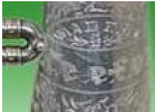
Style 4: oval with Keefer, sometimes highly engraved [by Charles Otto]