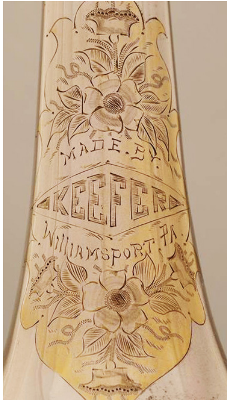
Style 3: large “KEEFER” in center [by Charles Otto]